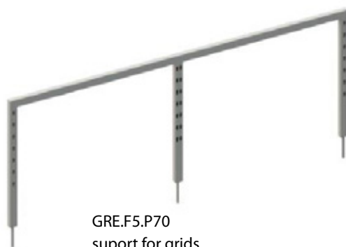
GRE.F5.P70 support for grids