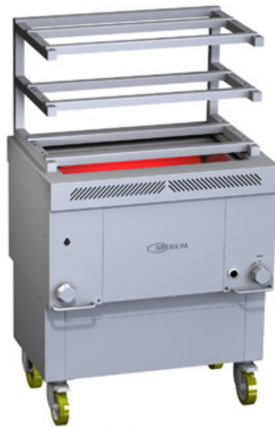
with Robata system