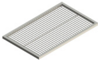
GRE.F2.G10 Rod grid round