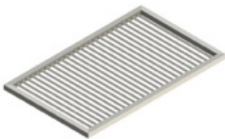
GRE.F2.G20 Square grid