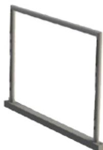
GRE.F2.P70 Support grids