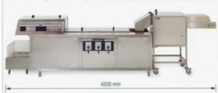
Salad cutting and washing line including Atirmatic and Stripper II

Company with EN ISO 9001 certified Quality Management System