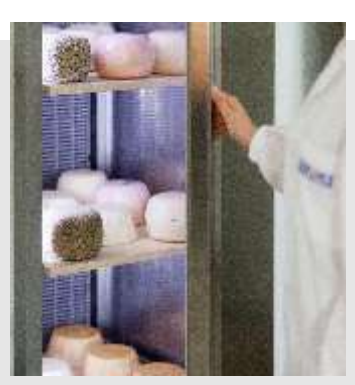
Preserved cheese, KLIMA STORAGE with stainless steel door