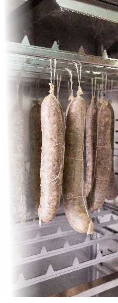
Salami during the first step of the aging process KLIMA FOOD CONTROLL SYSTEM

It can last between 4 and 8 weeks or more. During this phase temperatures must be kept around 10/15 °C and the relative humidity between 65-80%. Here we see the evolution of the microbial population naturally present and/or added, and the occurring of the main biochemical changes, which ultimately define the quality of the aging process.