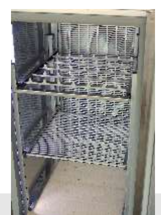
Patented frame for hanging salami, grill, evaporated wood plank