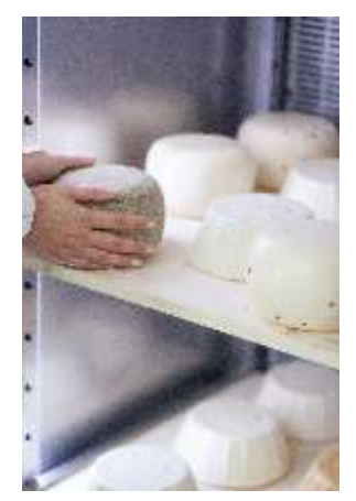
Cheese ripening inside KLIMA AGING SYSTEM

Salami without additives: thanks to the specific drying process, the exact adjustment of humidity and temperature, you shall have a «natural» maturation. Moreover, you can avoid the use of additives, keeping the complete control on the bacterial activity.