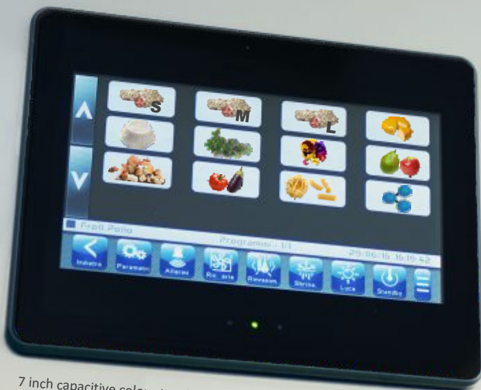
7 inch capacitive colour touch screen with high definition icons and graphic.

You can choose whether to use the many preset programs, partially modify the existing ones or create new ones from scratch, for producing unique and customized products. You can also save each new single parameter each single parameter into the device memory.