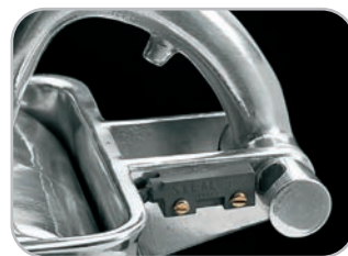
Microinterruttore su leva Micro-switch on lever