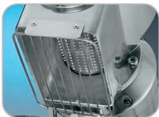
Griglia di protezione/rullo inox Protection grate/stainless steel drum