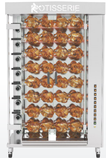
1175.8SMiG Stainless steel finish