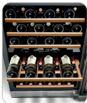
SOAVE / SALENTO