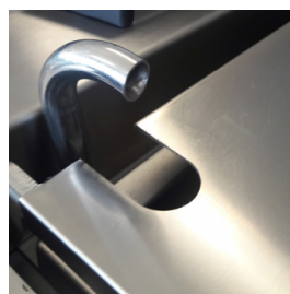
Manual water filling