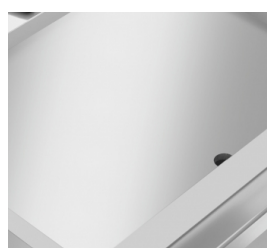
Plate welded to hob, thus guaranteeing a wider cooking zone and preventing the accumulation of dirt.

The plates tilt 10 mm towards the front of the appliance, optimising flow of fat into the drip drawer.