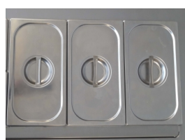
Different combinations of GN basins Examples: M40: 1xGN 1/1 o 3xGN1/3 M80: 3xGN1/3 + 1xGN 1/1

Equipment certified for low voltage directive 2014/35 / EU according to the international CB scheme.