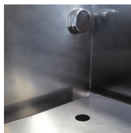
Integrated water tap in the tank