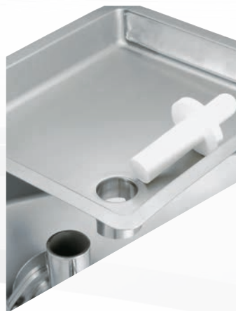
Easily removable meat tray entirely in stainless steel – suitable for dishwashers.