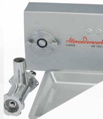
Easy removable worm housing for hygienic cleaning outside the drive removable mincer. e.g. for refrigerated storage.