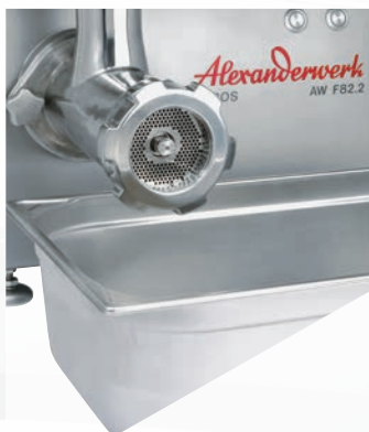
1/1 Gastronorm container fits underneath