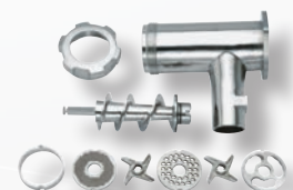
Easily removable external worm casing for hygienic cleaning.